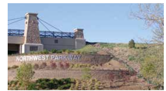
Tenant Identity Signage on Northwest Parkway