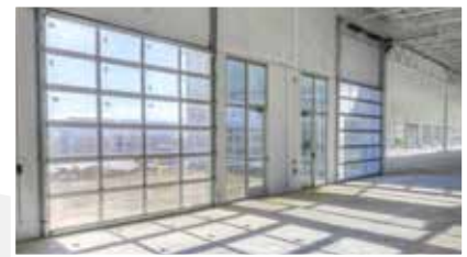
Glass Roll-Up Doors