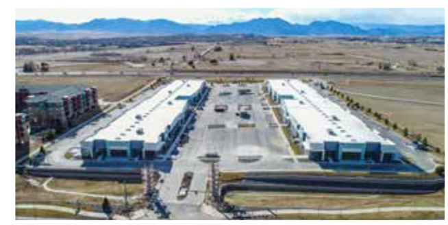
Flatiron Mountain Views

The unique working environment will showcase 12 foot high, floor-to-ceiling windows which will wrap all sides of the buildings to provide spectacular views of the nearby Flatiron mountains. The abundant natural light will maximize employee productivity while reducing energy consumption.