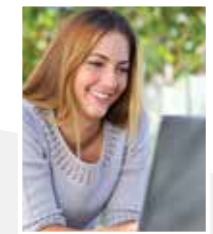
Outdoor Work Spaces